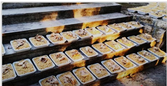
Dozens of meals being prepared: